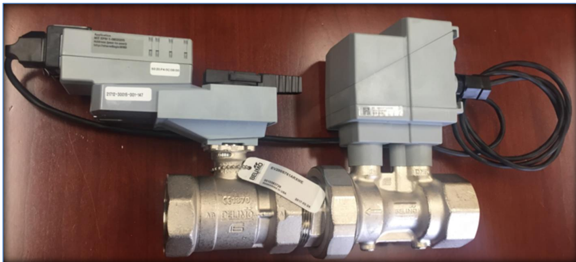
Figure4 – Image of Accessory PIV product with Integral Ultrasonic Flow meter.

Since this valve has constant pressure independent feedback of flow at all load conditions all manual hydronic balancing labor is eliminated.